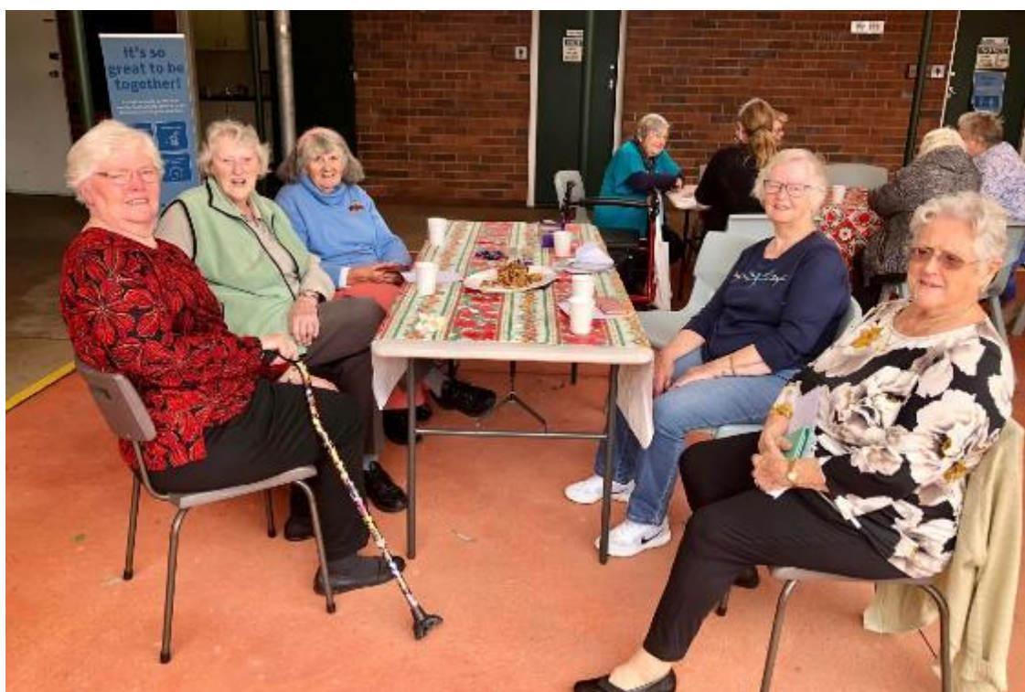
Christmas lunch together to end a year of lockdowns and Zoom meetings