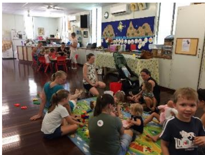
Group in Torres St learning about the Motto as they made a bookmark to take home during their "Coming of the Light" celebrations.