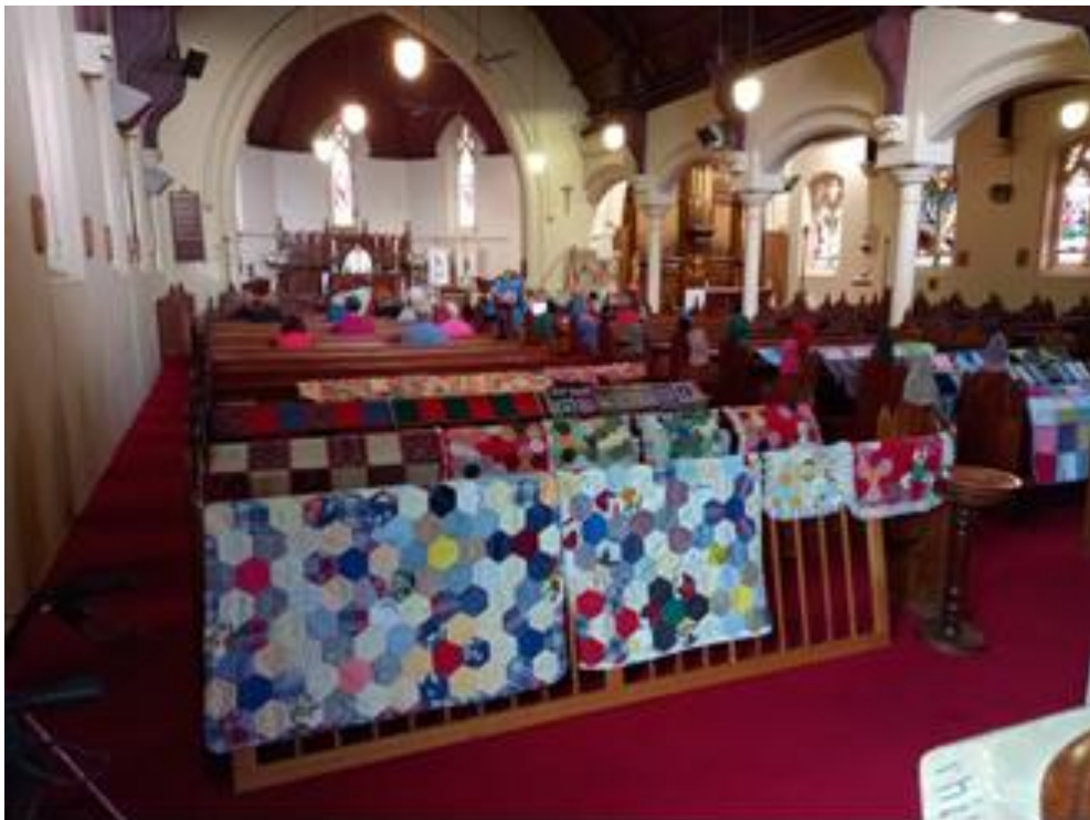
Ballarat quilts – just some of their handiwork given to those in need throughout the year