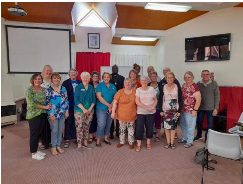
Group who travelled from Brisbane to Toowoomba for gathering with GFS members