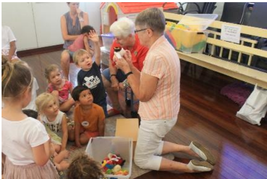
North Queensland Mainly Music group in action