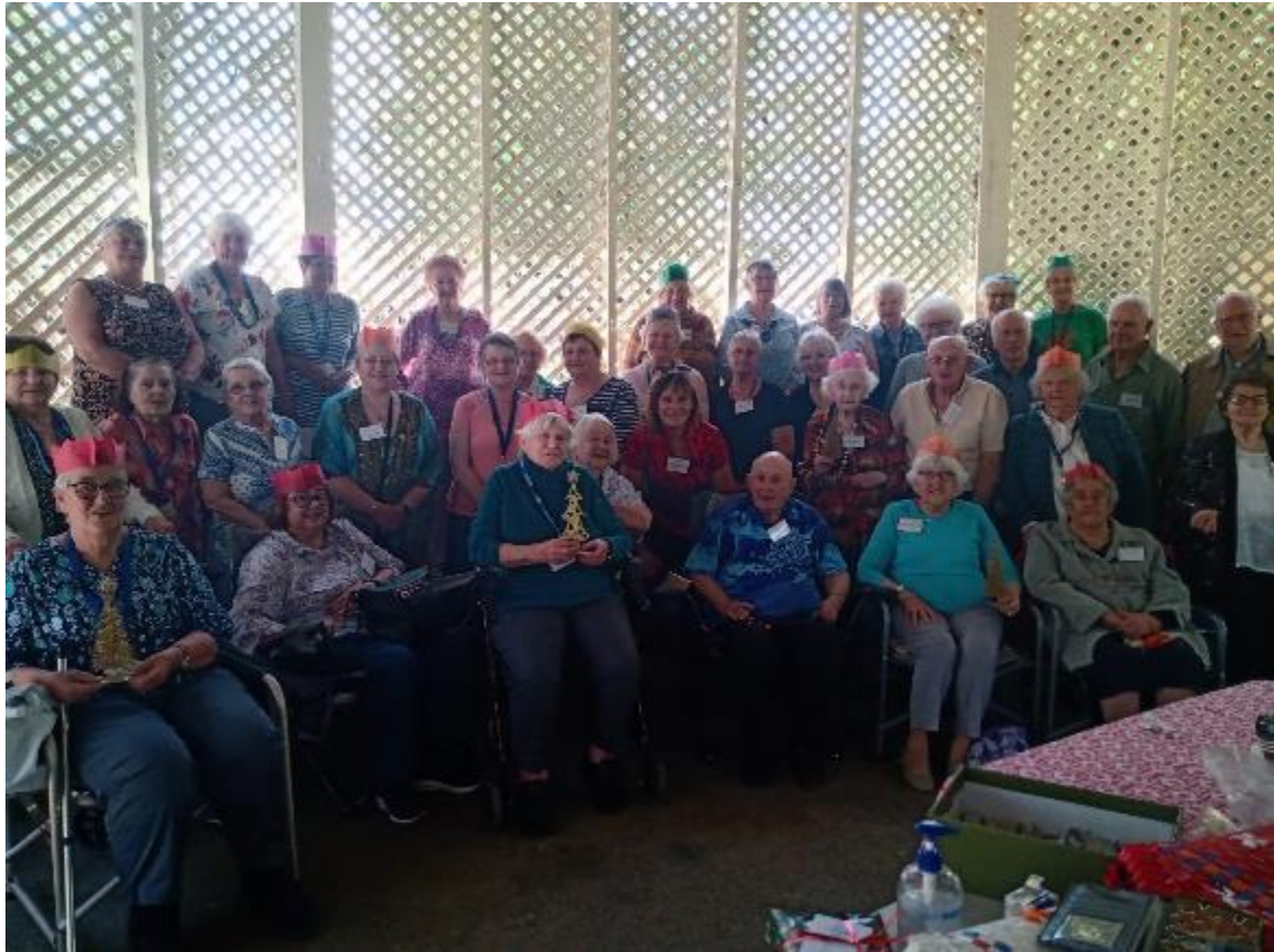
Ballarat GFS Group at their end of year picnic at Buninyong Gardens