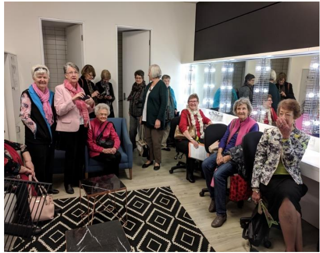
GFS Brisbane Outreach Group members toured the Backstage of QPAC – Queensland Performing Arts Centre in May 2019. Here we are in the Artist's Dressing/Makeup Room.